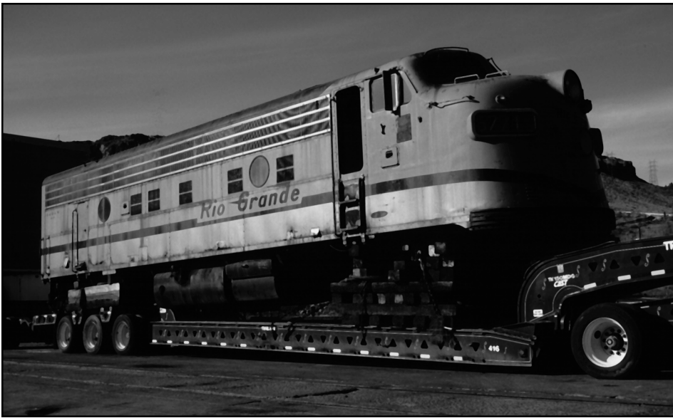
The Colorado Railroad Museum moved its donated Denver & Rio Grande Western RR F-7A #5771 from temporary storage at Coors Brewery to its Golden, CO, museum on January 27, 1998. The unit was used on the D&RGW's Rio Grande Zephyr between Denver & Salt Lake City, UT. The unit will be repaired and painted at the museum during 1998.