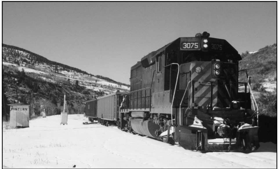
3075 and its two empty gondolas leave Minturn heading for Malta. This may be the last time a train passes this famous photo spot.

Due to the lack of railroad activity, the Union Pacific assigned a track maintainer to ride the engine along with the three man